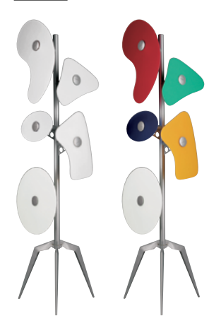
Brightness diffused light